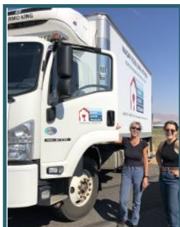
The Mobile Food Bank launched in September with routes in rural Klickitat and Skamania counties.